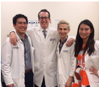
Residents and PD during the annual GW Skin Cancer Screening Day