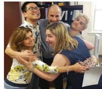
A team hug during the resident and faculty retreat.