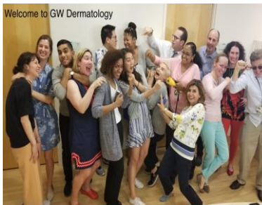
The scavenger hunt at this year's resident and faculty retreat got intense.