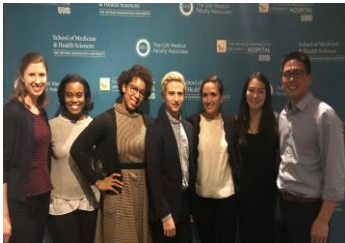
Residents and fellows at the April 2019 DC Derm Event hosted at GW.